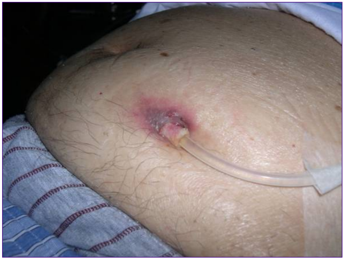
Figure 2: Exit site after chirurgical treatment

By using this treatment the only documented complication was the extrusion of the external cuff of the peritoneal catheter, which nevertheless did not translate into any clinical complication.